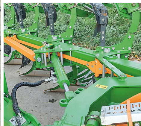
Three settings are changed hydraulically on the Tyrok 400V: front furrow width (left), depth (upper right) and working width (lower right). Operators have little cause for complaint on the setting options.

side. In this instance a 15m wide headland is sufficient. One benefit of a semi- versus a fully-mounted plough is the ability to delay lifting the back furrows, leading to shorter ins and outs at the headland, too, and a much tidier overall finish.