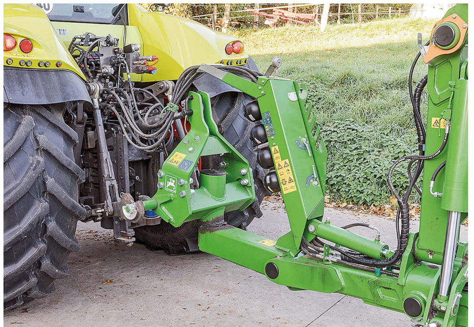
The headstock can be rotated 180° to either suit manoeuvrability (shown here) or better draft control.

For lighter tractors, we would recommend the traction booster, which is a £1,880 extra. We measured this with the outfit standing in the yard, and, with a maximum pressure of 180 bar, it placed 870kg on the tractor's back wheels. Around 70% of this comes from