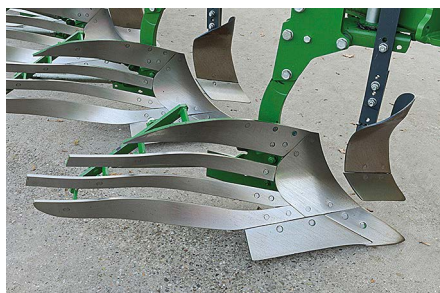
The STW35 body worked well in medium and heavy soils in all conditions...