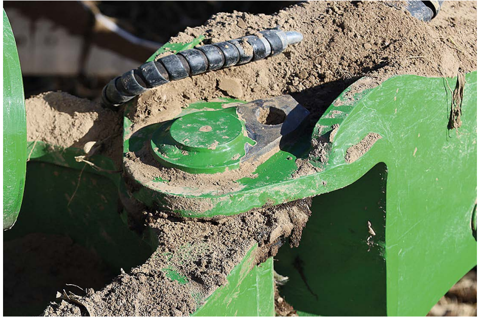
Amazone says that the weak point inside the pivot point of the land wheel has now been eliminated and shouldn't be a problem.

Amazone promises that when the working width is changed, the front furrow width adjusts automatically. We found there was