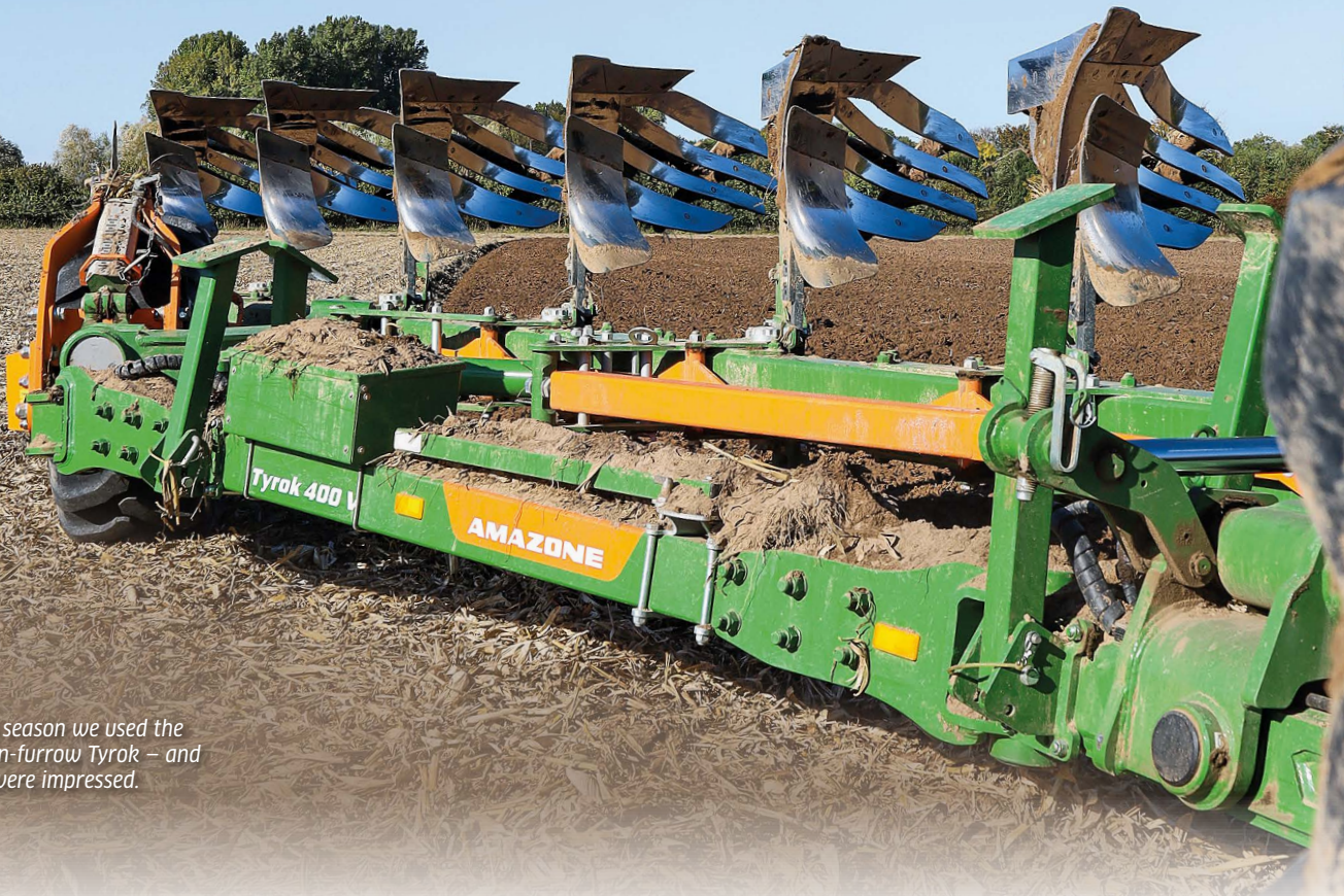
Last season we used the seven-furrow Tyrok – and we were impressed.

... but some cause for criticism. The semi-mounted Tyrok reversible, with new STW35 slatted bodies, reached its limits with us in just the one set of conditions. And its handling and operation were equally impressive.