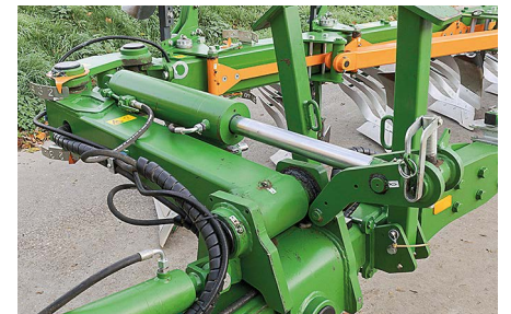
The plough's turnover ram has a three-step end-of-stroke cushioning system.

The turnover cycle is also very relaxed with