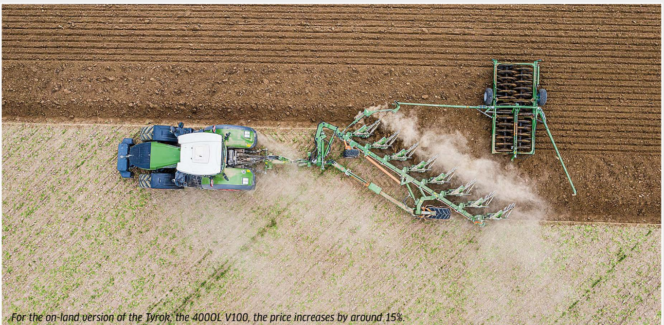
For the on-land version of the Tyrok, the 4000L V100, the price increases by around 15%.

According to the firm's list, an on-land version of our test plough would cost around £64,755.