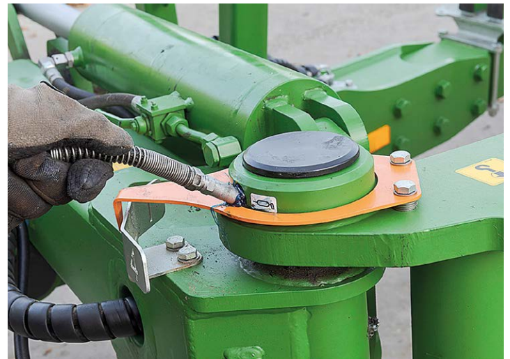
The sturdy box stores tools and other essentials (left). A 24/30 spanner is supplied with the machine. Not all of the grease nipples are easy to reach.

still room for fine-tuning. It also happened that the settings from the day before, no longer matched the next morning, therefore the hydraulic cylinder with a very nice scale helped with the setting up. Besides, people like to make this adjustment, and not just in hilly fields.